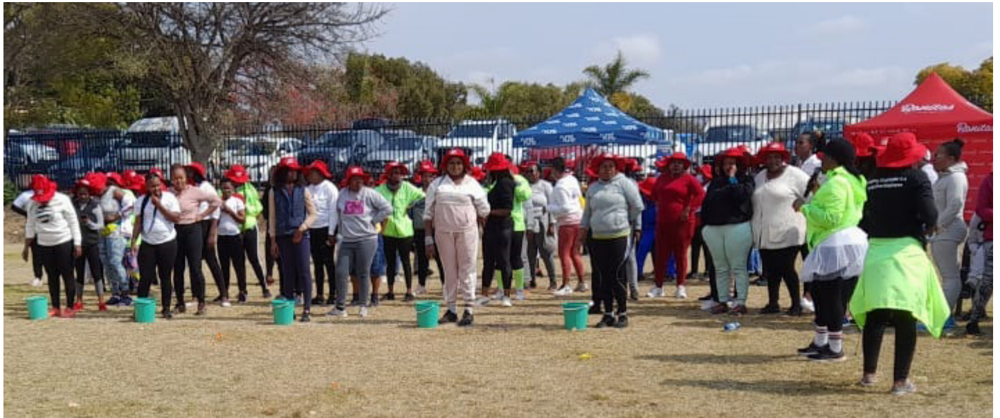
Departmental women participating in Tag of War during the Women in Sports Day at Noordeland High School.