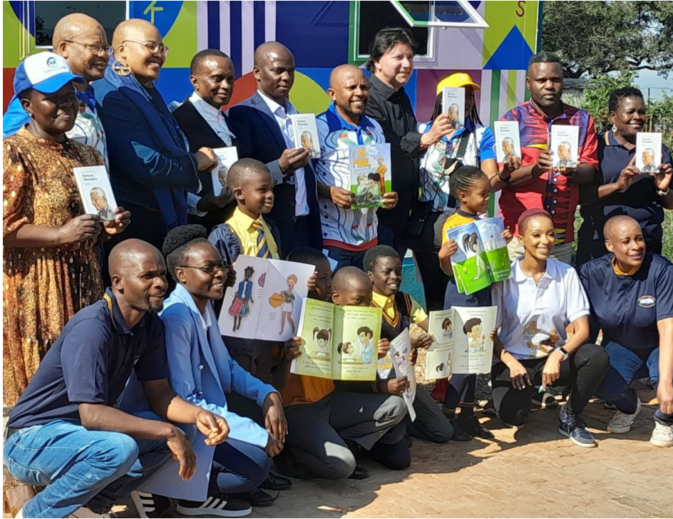
Literacy Hub Launch at Mamali Sikhwivhilu Primary School in Ngovhela Backside Village, Thohoyandou, Vhembe East District. The Department is working in partnership with Shout-SA, Nelson Mandela Foundation, Rotary and The Child Foundation in this project.

Sibasa - Limpopo Department of Education in partnership with Shout SA, Nelson Mandela Foundation, Child Upliftment Corner Foundation, Rotary International and Literacy 4Life converged to Mamali Sikhwivhilu Primary school outside Thohoyandou for the launch of 'Sasaladzi a Fhulufhelo' Literacy Hub on the 29 July 2022.