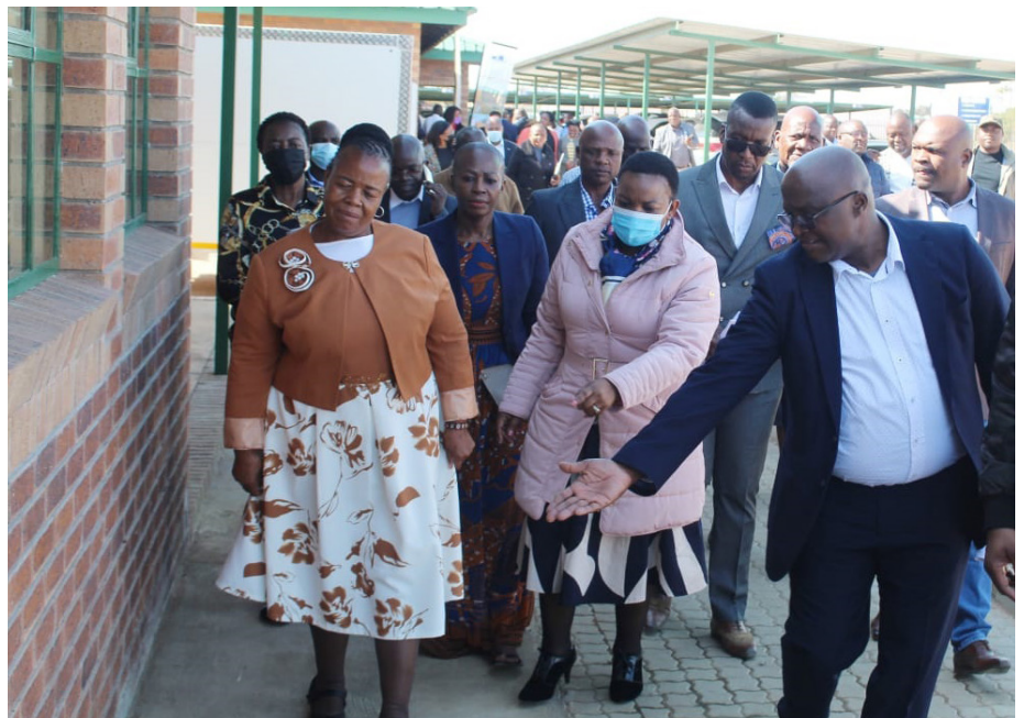
MEC Mavhungu Lerule-Ramakhanya (centre) entering a newly built Nutrition Block.