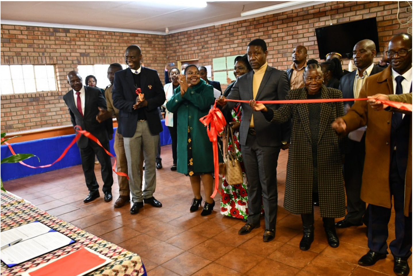
Minister Ronald Lamola officially opens the computer laboratory by cutting the ribbon.