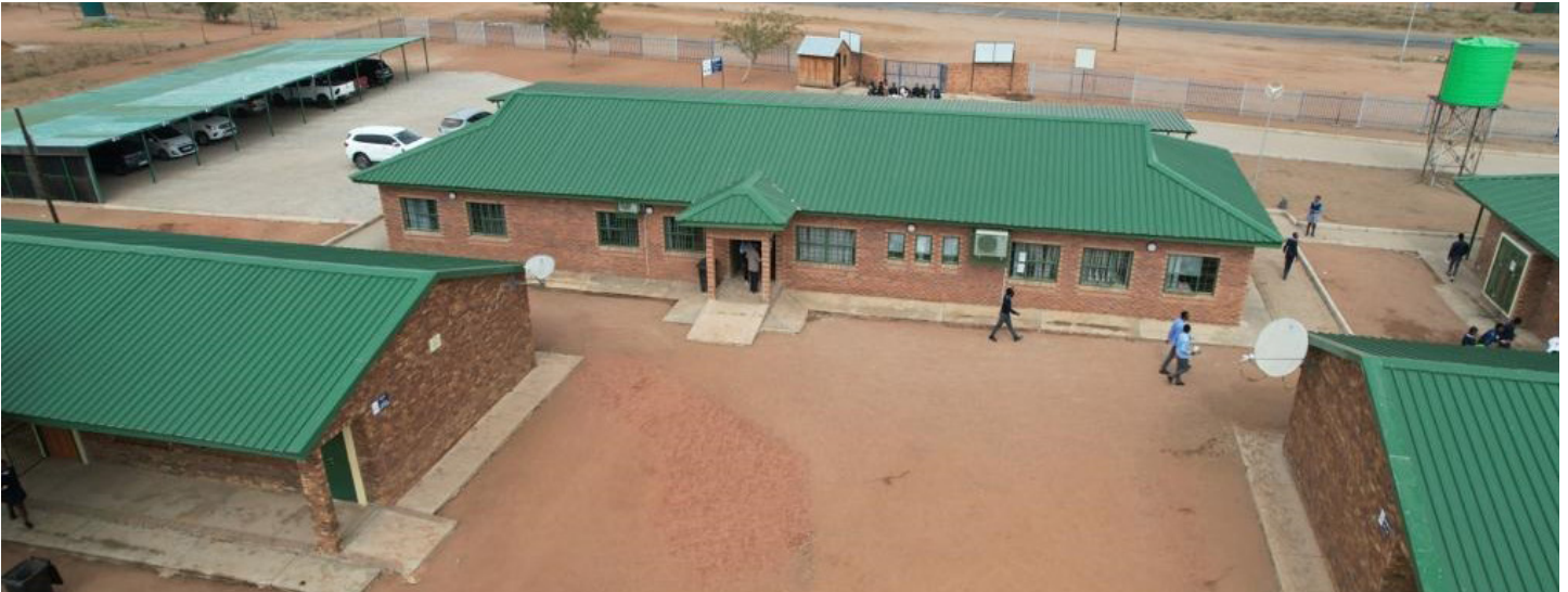
Renovated and newly built Classroom Blocks of Kgolouthwana Secondary School.