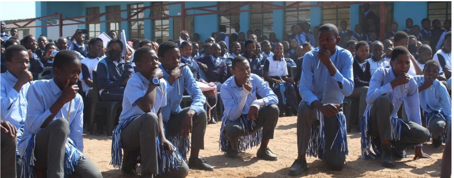
Kgolouthwana Secondary School learners performing 'Dinaka', Sepedi traditional men dance.