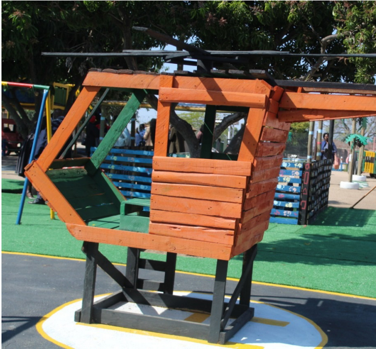
Creative and educative natural playgrounds for Grade R learners in Mopani West Education District, Makhutswe Circuit.