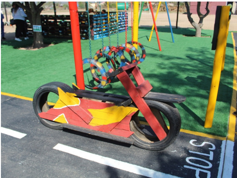
Creative and educative natural playgrounds for Grade R learners in Mopani West Education District, Makhutswe Circuit.