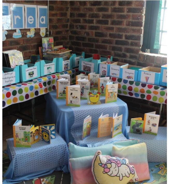
Grade R classroom nicely packed one of the ECD centres in Makhutswe Circuit.