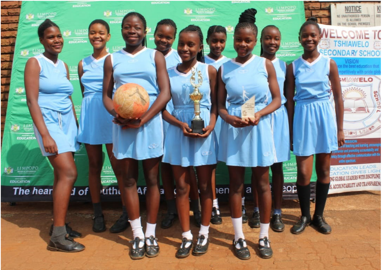
Tshiawelo High school from Elim Circuit was crowned the U/14 Ubuntu netball champions.