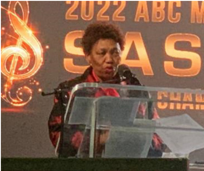
Minister Angie Motshekga giving a keynote address at the 2022 ABC Motsepe SASCE National Championship at Rhema Bible Church in Johannesburg.