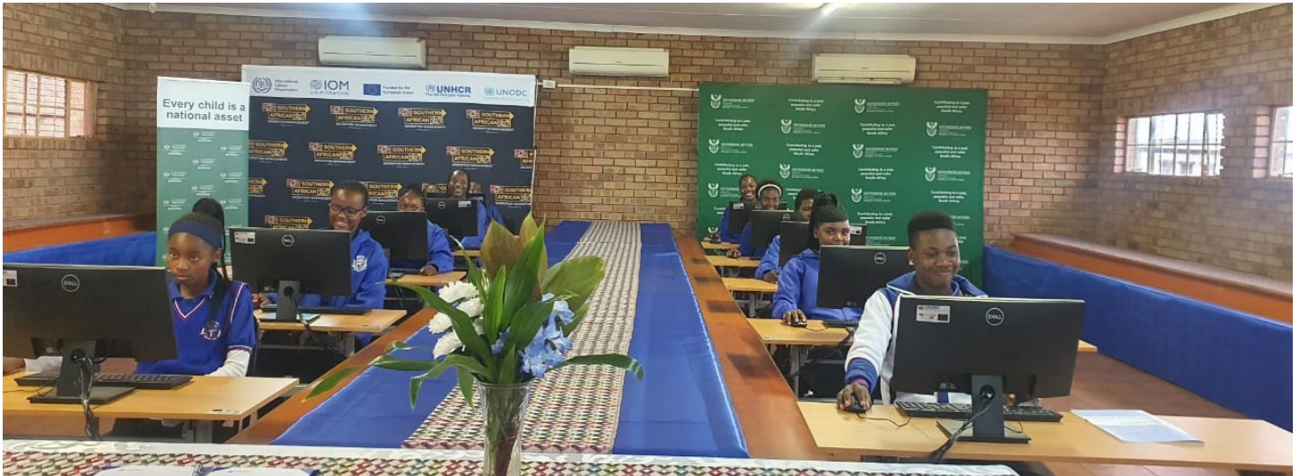
Mphaphuli Secondary School computer laboratory officially opened by Minister Ronald Lamola.