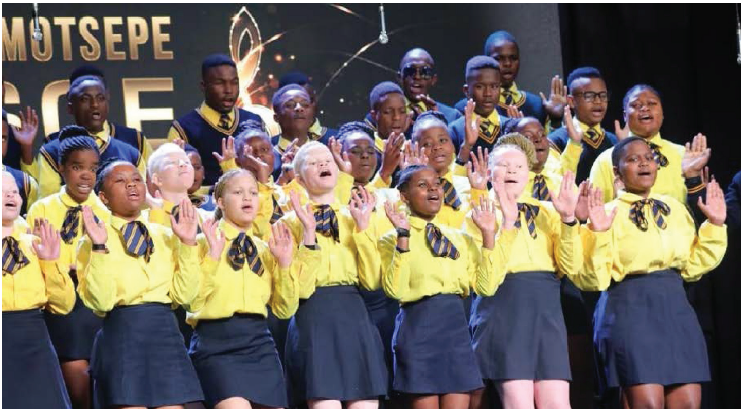
Setotolwane Elsen Secondary School, in Maraba Circuit, Capricorn South District obtained Position 2 at the 2022 ABC Motsepe South African Schools Choral Eisteddfod (SASCE) National Championship.