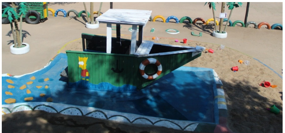
Creative and educative natural playgrounds for Grade R learners in Mopani West Education District, Makhutswe Circuit.

This program has undoubtedly transformed classrooms because they were embroidered with lots of charts which were not in line with the pacesetter for a particular quarter. The layout of Grade R classes is known, with relevant teaching aid per quarter. For instance, Grade R learners should at times wear uniform apparel that would accord them free and adequate movement to play without