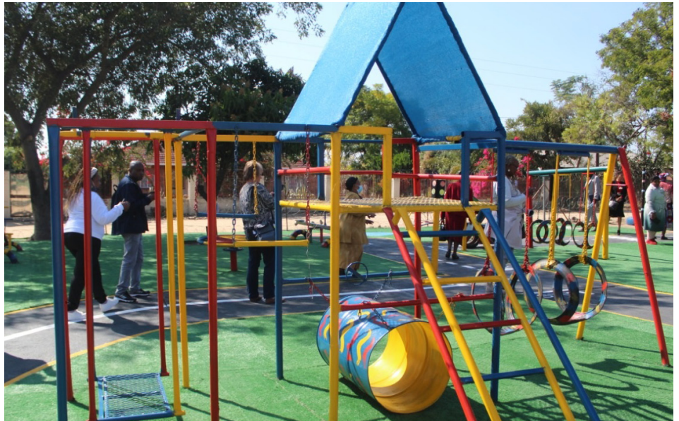
The School Readiness Initiative Programme (SRIP) under Molteno's flagship programmes funded by the Roger Federer Foundation (RFF), including Penreach SA and Read Education Trust visited the creative and educative natural playgrounds for Grade R learners in Mopani West Education District, Makhutswe Circuit.

The program of improving and modifying Grade R playgrounds and classrooms started in February 2022 in the Mopani Education District and it has already been concluded in the Capricorn and Sekhukhune Education Districts respectively after schools adopted their budgets to procure adequate Grade R material and resources.