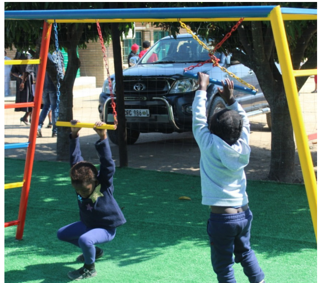
Grade R classroom nicely packed one of the ECD centres in Makhutswe Circuit.

Term 4: Dinosaurs, Birds and Reptiles, Wild Animals, Sport, celebrations.