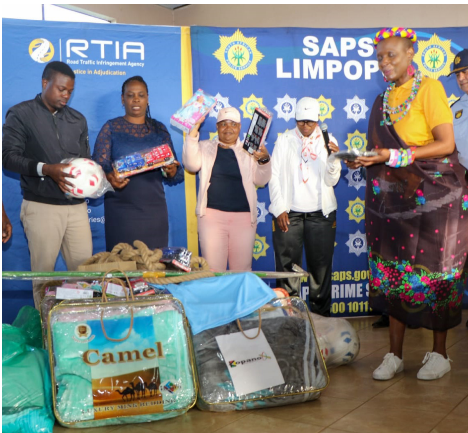
Principal of Rivoni School for the Blind(far right) receiving the donated gifts from the Hawks, SAPS and other stakeholders.

know that it is only about 67 minutes, but today we use our 67 minutes to remember how Tata Mandela made the world made a better place for humanity by taking our 1,5km walk with our learners from Rivoni school for the Blind,