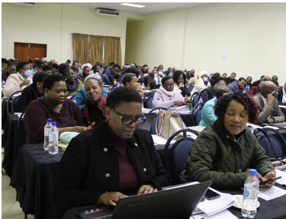
Participants from all public schools across the province at the 3 days Workshop in Royal Hotel, Polokwane.