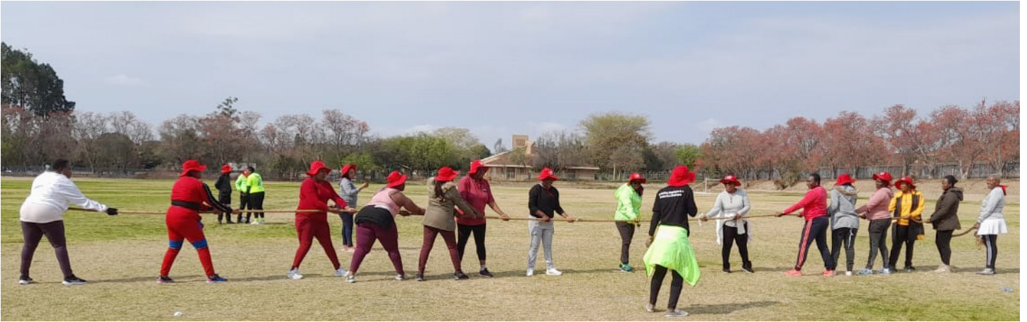
Departmental women participating in Tag of War during the Women in Sports Day at Noordeland High School.