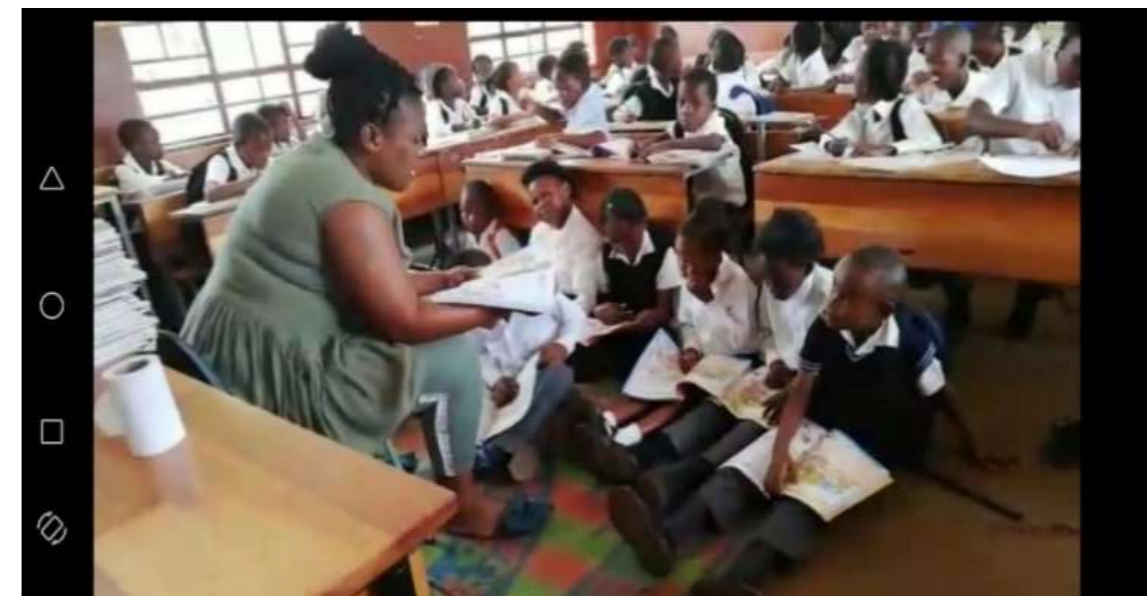
Figure 4: Reading for academic purposes

A multifaceted approach for this thrust comprises the following key deliverables: