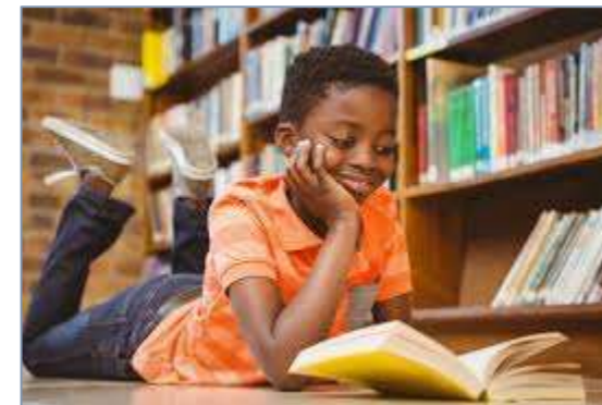
Figure 3: Reading for leisure

• Mobilising reading resources from organisations that are ready to donate readers. These reading resources will be in all languages spoken in the province and housed in reading clubs.