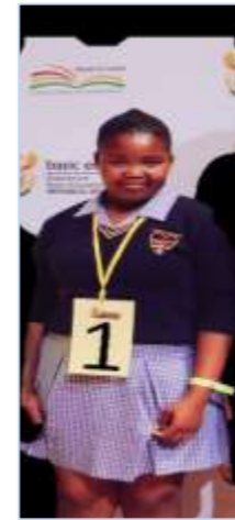
Figure 1: 2018 Spelling Bee Winner

Reading is an essential part of one's life. Past decades have seen steady decline in the number of people who regularly read for pleasure, enjoyment and leisure. Reading a book prescribed by the Department as part of the official curriculum is a completely different experience to reading a book you have chosen for yourself. The benefits of reading a book of your choice compared to reading a book one is compelled to read, bring a different learning experience to children and learners.