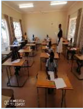
Figure 2: Reading for academic purposes

The reading activities that comprise this thrust are usually confined to formal spaces such as classrooms and libraries. Such reading activities are designed to ensure learners attain the standards prescribed in the annual teaching plans of the official curriculum. These could include preparing answers for possible questions that may come up in a test, sourcing information for an assignment, learning how other nations solved problems in South Africa, and so on.